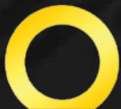
exhibit 3 sixty