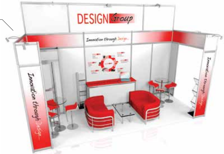
Example 2 (5m x 3m) Price: £3,500.00 15m 2