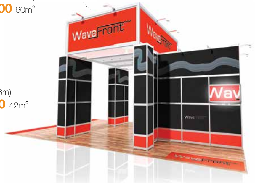
Example 7 (7m x 6m) Price: £8,000.00 42m 2