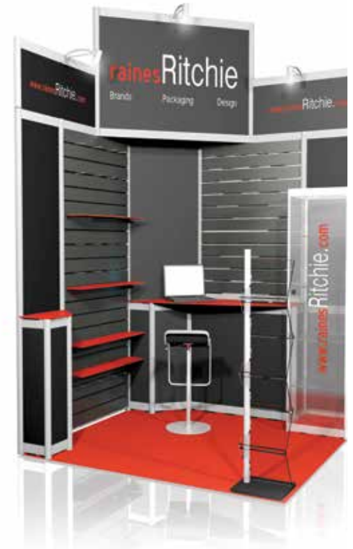
Example 5 (2m x 2m) Price: £2,200.00 4m 2